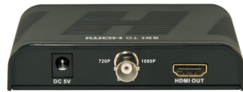
SDI TO HDMI Converter